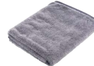
Waterwin Drying Towel Half

SIZE 90 X 70cm Material polyester 70% / nylon 30% Color ● ● ○ ● ●