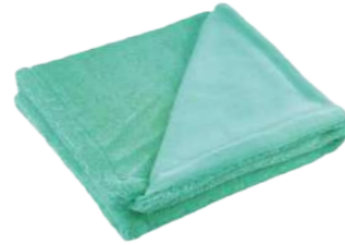
patented product Blackhole Drying Towel Half

SIZE 90 X 70cm Material polyester 80% / nylon 20% Color ● ● ● ● ●