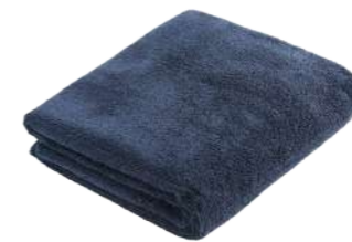
Ambos Double-sided Drying Towel

SIZE 65 X 45cm Material polyester 80% / nylon 20% Color ● ● ● ● ●