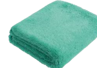
2in1 Drying Towel

SIZE 65 X 45cm Material polyester 70% / nylon 30% Color ● ● ● ● ●