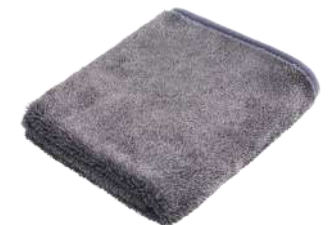
2in1 Drying Towel Half

SIZE 90 X 63cm Material polyester 80% / nylon 20% Color ● ● ● ● ●