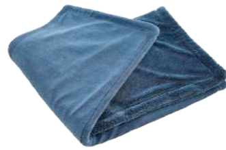
patented product Blackhole Drying Towel

Patented dry towels that can be used in one sheet with two different types of towels of different lengths