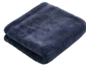
Mega Drying Towel Half

SIZE 86 X 74cm Material polyester 80% / nylon 20% Color ●