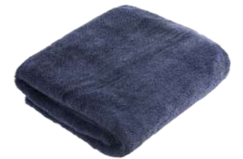
Mega Drying Towel

SIZE 66 X 50cm Material polyester 70% / nylon 30% Color ●