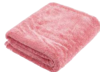
Waterwin Drying Towel

SIZE 65 X 45cm Material polyester 80% / nylon 20% Color ●