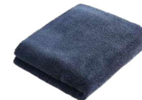
Ambos Double-sided Drying Towel Half

SIZE 90 X 70cm Material polyester 70% / nylon 30% Color ●